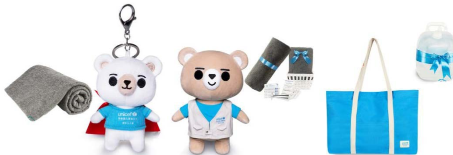
Figure 3. Samples of promotional products

In conclusion, based on the SWOT analysis we did for UNICEF, we have noticed two major causes explaining why UNICEF has lacked market power in China: one is the insufficiency of the market campaign, and the other is the perception of philanthropy. As a result of these findings, our major suggestions for UNICEF is to enhance its product design and shift their target audiences to the younger Chinese population.